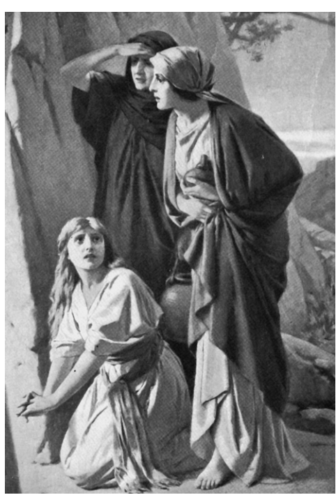
Women at the open tomb on Easter morning, late 19th century lithograph

adversary the devil prowls about like a roaring lion, seeking some one to devour. Resist him, firm in your faith, knowing that the same experience of suffering is required of your brotherhood throughout the world" (1 Pt 5:8-9). In all our trials and sufferings it is important to remember that the devil is present, always trying to disrupt our faith and make us turn away from God. Like Jesus' temptation in the desert, we should fill our minds with Scripture and rely on the power of God's Word (see Lk 4:1-13), "taking the shield of faith, with which you can quench all the flaming darts of the evil one" (Eph 6:16). The goal is to end our lives with our eyes on Heaven: "Fight the good fight of the faith; take hold of the eternal life to which you were called when you made the good confession in the presence of many witnesses" (1 Tm 6:12) and, with St. Paul, to be able to say, "I have fought the good fight, I have finished the race, I have kept